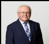
Robert Fitzgerald AM Commissioner, Royal Commission into Institutional Responses to Child Sexual Abuse